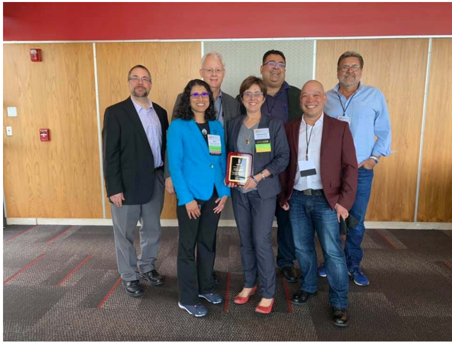
WISAM Board of Director Members Present at Conference on 09.26.2019